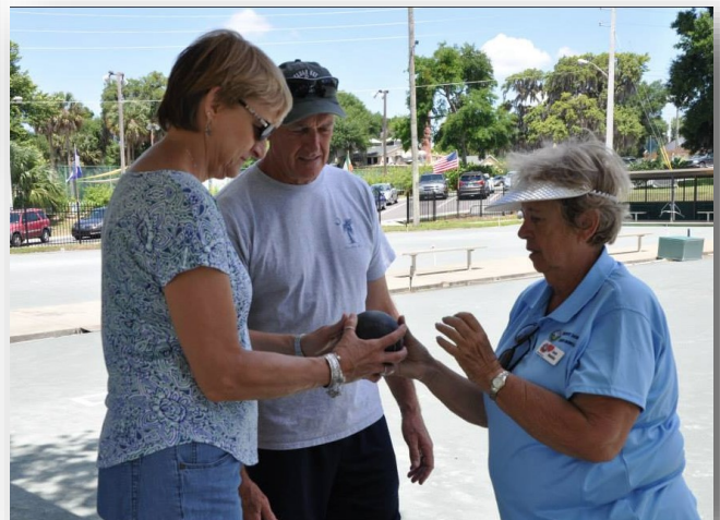
Open House at Mont Dora LBC

Chairperson, Publicity & Marketing Committee