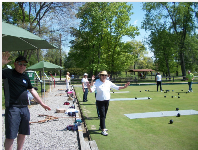
Open House at Cincinnati LBC, May 2, 2015

May 2, we opened our bowling season with an Open House hosting 30-plus people. Since then, we've bowled six times and hosted an afternoon class for "adults over 50" through the University of Cincinnati. We're off to a great start with 162 bowlers so far...and no rain days. We apologize to Mme. Killdeer who laid her eggs two feet from the edge of the green. No matter how far away we stayed she loudly chided us and gave us "the look".