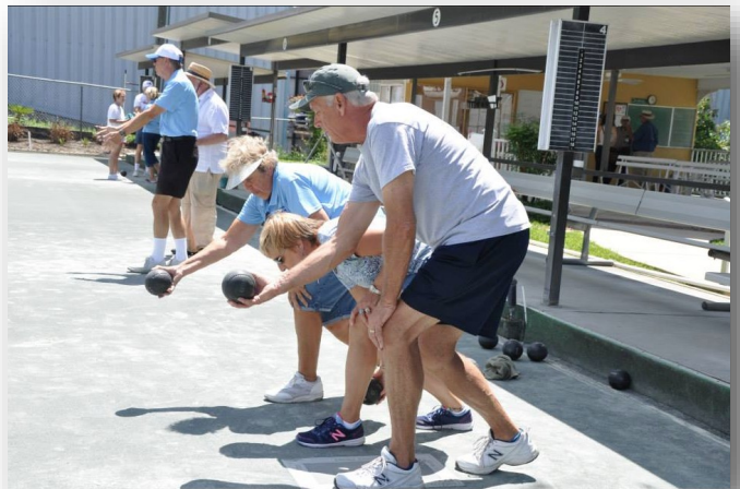
Open House at Mont Dora LBC