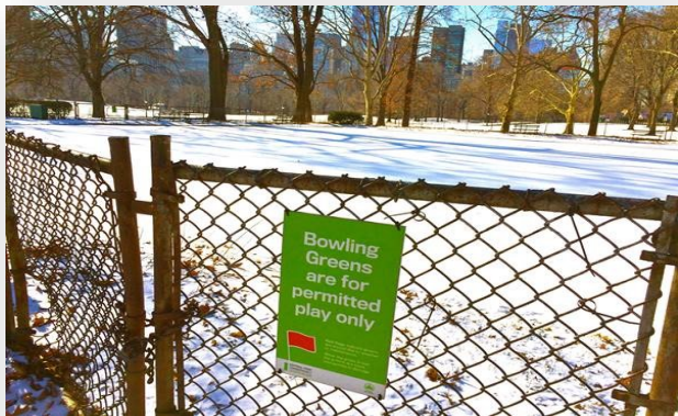
New York City Bowling Greens in winter.