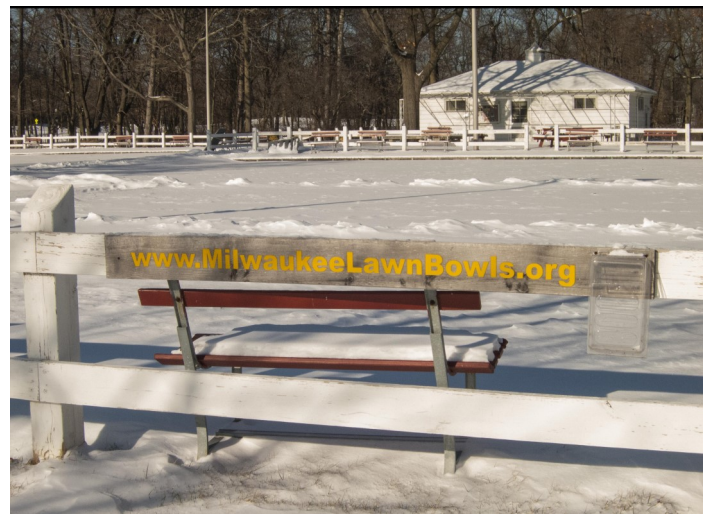
Milwaukee Lake Park LBC, Milwaukee, Wisconsin

Photo taken January 7, 2015 at 1 p.m. by Carl Landgren. "No one is available for the afternoon game."