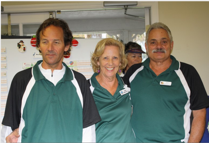
1st Place Winners of the Mount Dora Holiday Bowl

Also, a big thank you to the sponsors: Lakeside Inn, McDonald's, Quality Design &Print, Publix Super Markets, Mount Dora Community Trust and the Lake County Office of Economic Development & Tourism.