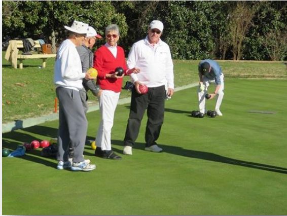
Two days after Christmas and the warm weather brings out the Williamsburg bowlers.