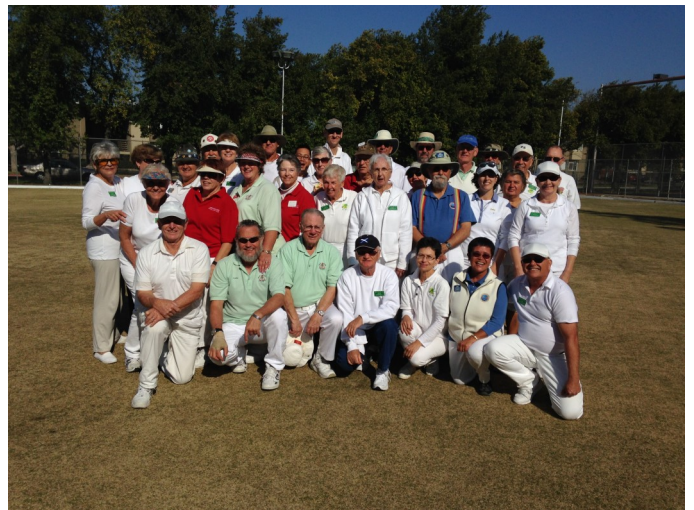
PIMD and Fresno LBC'S

After a fall-themed spider to start the day, teams played either pairs or triples in 12-end games, enjoyed a brown bag lunch and got right back on the green for a second go at winning the big bucks that the usual $3 entry fee provided! After the game, one member commented, "This was the best day of lawn bowling I've had in my life!" The "Fresno Fall Friendship Game" will be on the calendar again for 2016! Come bowl with us!