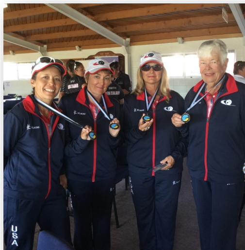
Bowls USA Women's Fours Team Wins Silver