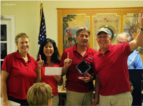
"Visit Mount Dora, Inc." winners of the Mount Dora Bowling Blast.

An overwhelming majority of the players indicated in their completed surveys that they will play in future such tournaments in 2016. Twenty-four players requested information on the benefits and costs of joining the club.