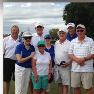
Bowlers from Mount Dora are in light blue shirts, Lakeland in dark blue shirts and The Villages in white shirts.