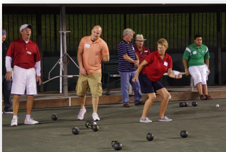
Getting into the game during the Mount Dora Bowling Blast.