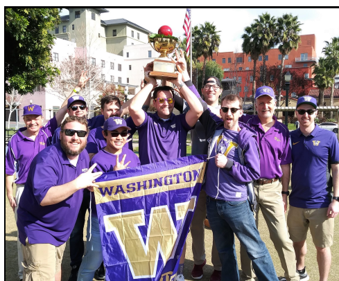
The Huskies celebrate the Rose Lawn Bowl win!

You may want to make this one of your annual traditions . . . the atmosphere is exciting and entertaining because these football fans bring with them the passion and competitive spirit that makes them diehard fans in the first place.