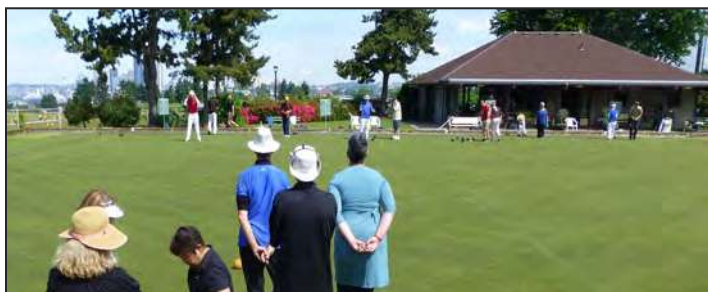
Jefferson Lawn Bowling Club, Seattle, Washington

Please identify yourself and your region to show