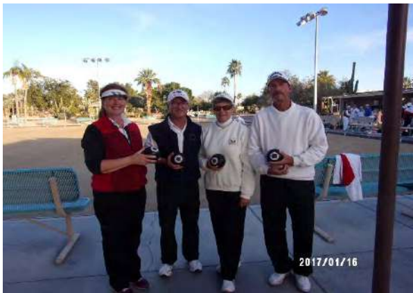
Arizona Rinks, First Place Winners