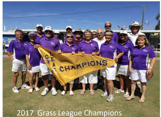
2017 Grass League Champions

Sun City Center, Sarasota and Lakeland clubs finished up the four weekly sessions of the 2017 West Coast League (formerly the Grass League) tournaments. As a result of their win, once again, the original "Grass League" flag flies at Sarasota for the next twelve months.