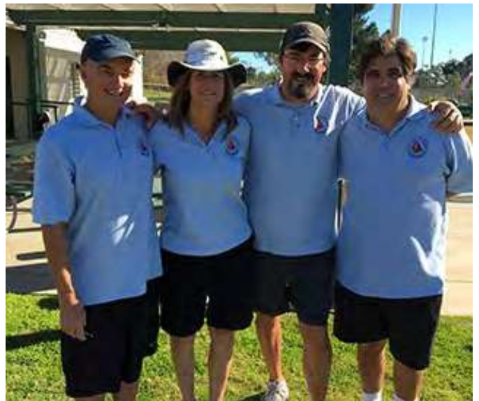
The Long Beach Gold Team - Winter League Champs!

Newport 1 Beverly Hills Alhambra and Newport 3