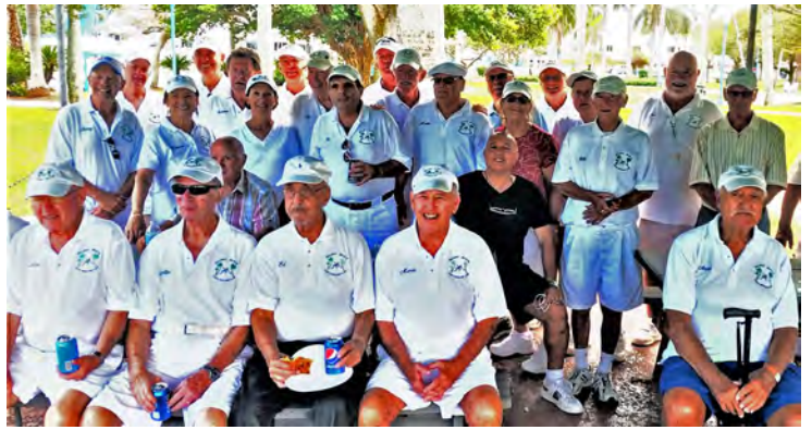
The Delray Beach LBC held a North vs. South Tournament.