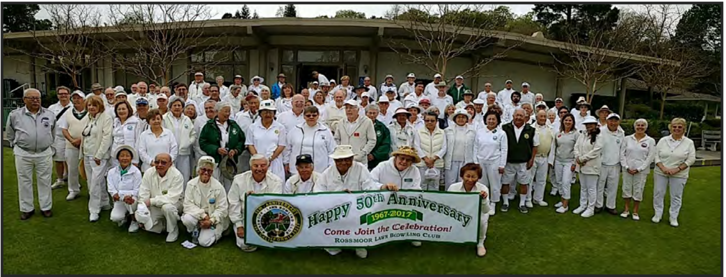
Over 100 bowlers assemble for PIMD Opening Day at Rossmore LBC