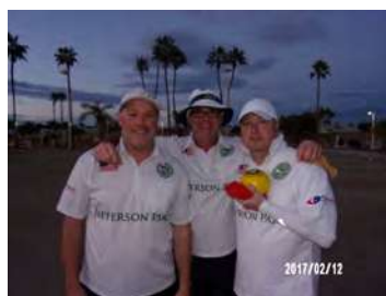
First Place Men's Triples