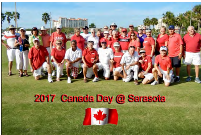
The Big Winners, "The Happy Bowlers."

After bowling, all bowlers, friends and former members enjoyed snacks and socializing. Some tried their skill in drawing closest to the jack contests. The big winners were the "Happy Bowlers" who gathered for a photo at the end of another successful Sarasota Bowling Club activity.