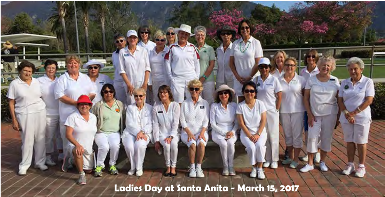
Ladies Day at Santa Anita - March 15, 2017